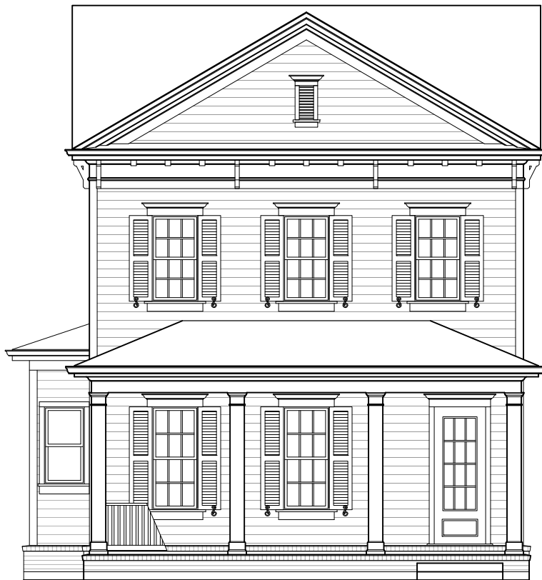
FRONT ELEVATION LOT F-027 - THE ASHLAND

DISCLAIMER: Features of Home are subject to adjust based on building plans. Buyer to verify prior to purchase contract. Information deeded reliable but is in no way guaranteed or warranted by the Owner or The Cobbel Agency. Buyer must satisfy his/herself regarding any provided information prior to closing.